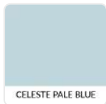
CELESTE PALE BLUE