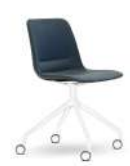
Unica Swivel Upholstered