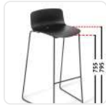
755mm Seat Height