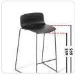
655mm Seat Height