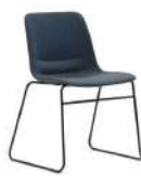
Unica Sled Upholstered