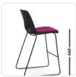
640mm Seat Height