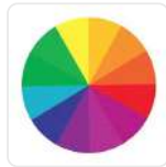
Other Advanta Standard Powdercoat Colour (special order)