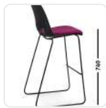
740mm Seat Height