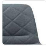
Comfort Diamond Quilted Upholstery Detail