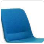
Duo Upholstery Detail