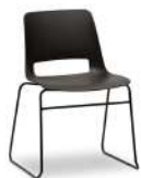
Unica Sled PP