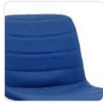
Comfort Straight Quilted Upholstery Detail