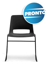
Unica Sled PP 'Pronto'