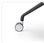
Chrome Castors / Black Tyre