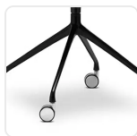
4 Way Base - Fixed Height