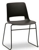
Unica Sled PP