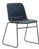
Unica Sled Upholstered